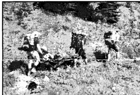
Hiking the trail on Access Challenge

Opportunities Society, this was the fifth Access Challenge.