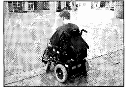
No service in sight

For more on this story, visit www.disabilityfoundation.org/news