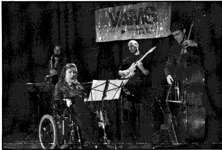
Jayne's Gang on stage at Performance Works in December

Each has a significant physical disability. The lunchtime musical showcase was presented by the Vancouver Adaptive Music Society, a Vancouver-based, non-profit association working to open doors for musicians with physical disabilities.